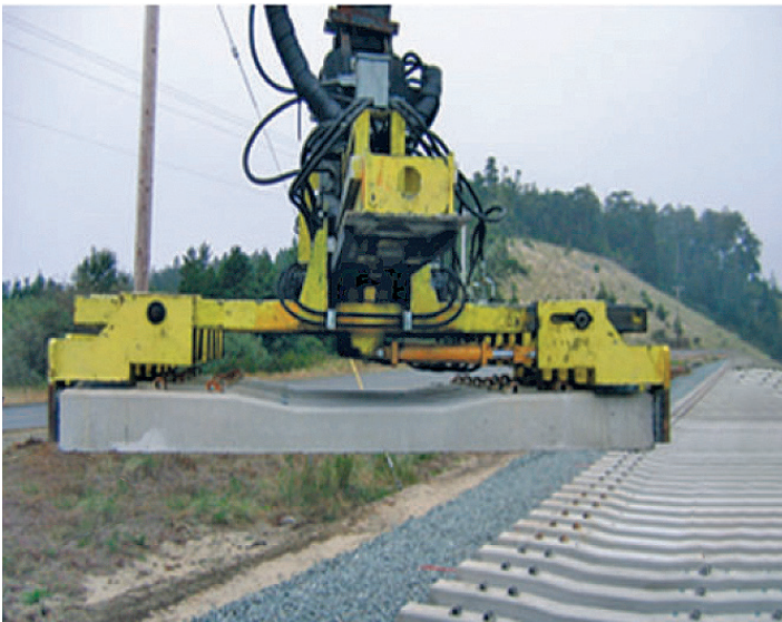
Efficient installation using hydraulic clamp

The 200S-50 tie is designed for use with Safelok III fully captive fastening system. These components are chosen for their performance, cost and ease of installation.