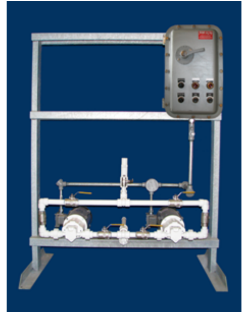
Chemtec Dual Pump Assembly with Viking Mag-Drive Pumps